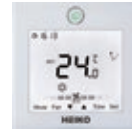
YR-C01 wired controller (optional)